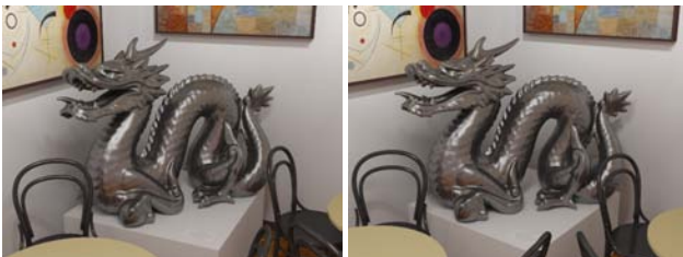
Figure 3: The two camera viewpoints used to render stimulus images for the experiments.

“Our research is on perceptually-based rendering, which means that we are trying to take advantage of the properties of human vision to make the computer graphics rendering process more efficient. If we do our job well the images look good and the renderings go fast, but if we push things too hard then artifacts can appear in the images. Here on the screen are examples of some of the images you will see in the experiment. [Shows the image in Figure 4, a composite of 12 different stimulus images, some with visible artifacts.] Do you see any images that you would say have artifacts? [Subject typically points to an image with clearly visible spots and speckles.] Do you see others? [Subject points to other images with artifacts of lesser degree.] In the experiment you will be shown pairs of images