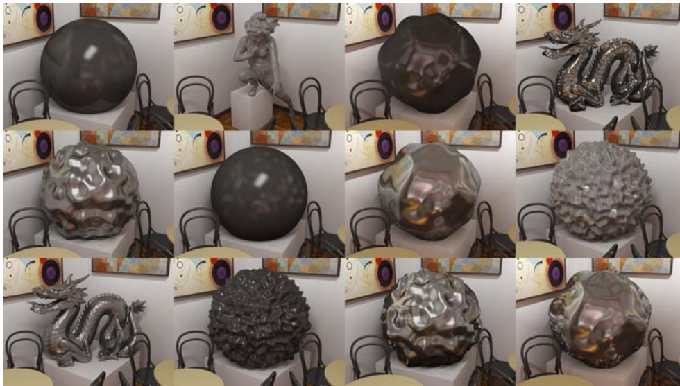
Figure 4: Familiarization image shown to subjects prior to the artifacts threshold study.

The images were rendered in high dynamic range (HDR) and were all tone-mapped for display using the global version of Reinhard et al.'s photographic tone mapping operator [2002]. The tone-mapping parameters were set manually such that the low reflectance objects ( \rho_d = 0.03 ) appeared black. We used two different tone mapping settings for the direct-and-indirect and indirect-only illumination to equalize the energy differences in the images. The same tone-mapping curve was then used for all shapes, materials, VPL counts, and clamp levels.