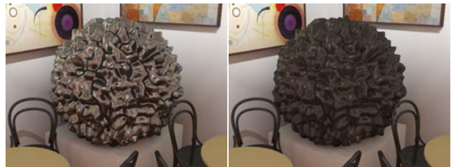
(b) indirect-only, G3, MS → BS, 100k, C1