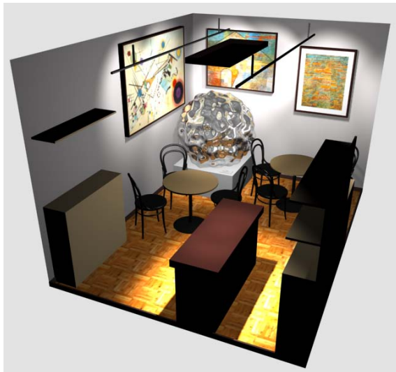
Figure 1: A rendering of the art gallery café scene used to create the stimulus images. The walls adjacent to the camera and objects thereon were hidden in this image to allow an unobstructed view of the interior. Note that this image was rendered in 3ds Max using a different rendering algorithm than the one we used to produce the stimulus images, and therefore should not be considered as a reference for illumination.

Lighting included both spot and area fixtures. The geometry of the spot fixtures was not present in the scene to save modeling effort. We ran the experiments with two different versions of illumination: indirect-only and direct-and-indirect. In the indirect-only version, only the spot lights were on. These were configured such that they