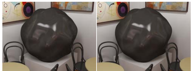
(d) direct-and-indirect, G1, BS, 100k → 5M, C6