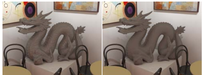
(c) indirect-only, Dragon, GS → diffuse, 100k, C2