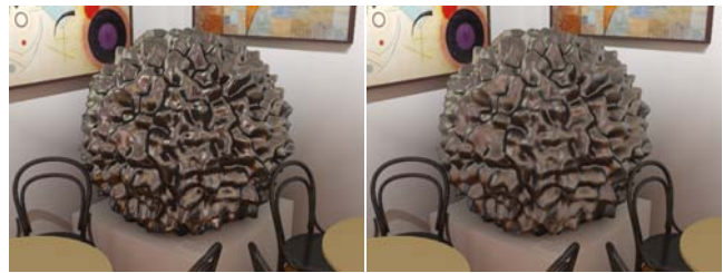
(a) indirect-only, G3, MS → MR, 100k, C2