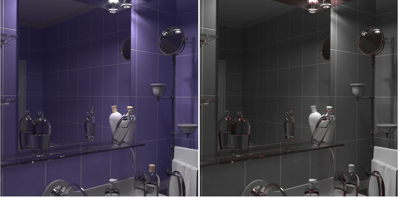
Figure 3: Bathroom scene. Left: intensity of the computed light, right: degree of polarisation overlaid over a grayscale image