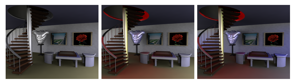
Figure 3: Examples of edits on glossy surfaces. The left image shows original rendering with global illumination and the remaining two images show our edits. In the middle image we made the cylinder above the staircase emit red indirect light, changed indirect hue on the glossy staircase piece and on the glossy statue torso. In the right image, we added a more bluish tone by reflecting more indirect light off the ceiling towards the floor and the wall.

J. Obert, J. Křivánek, F. Pellacini, D. Sýkora, S. Pattanaik / iCheat: A Representation for Artistic Control of Indirect Cinematic Lighting