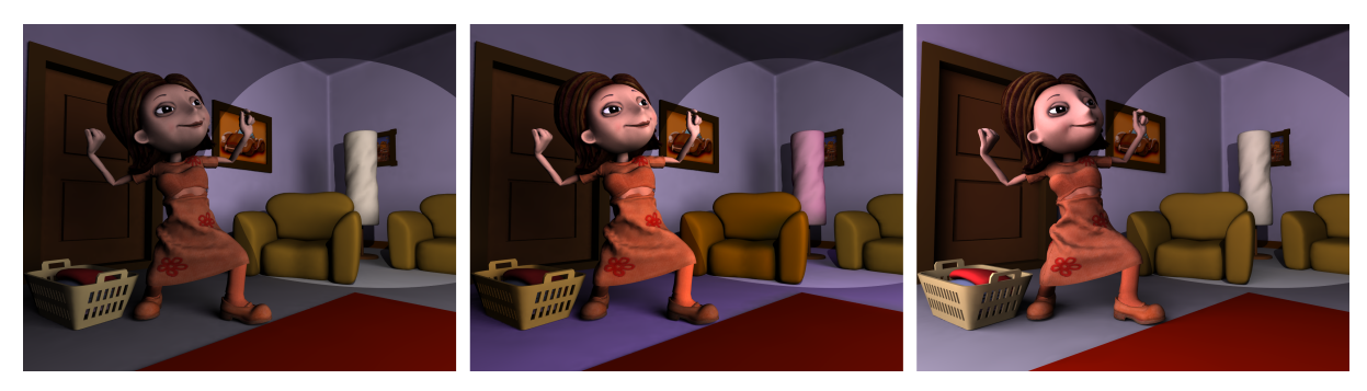
Figure 1: Artistically modified indirect illumination. The left image shows original unmodified global illumination. In the middle image we directed more indirect light at the character, bringing her into focus. In the right image we modified hue/saturation of indirect lighting hitting the room and changed its directionality to make the character appear lit from her right-hand side.

J. Obert, J. Křivánek, F. Pellacini, D. Sýkora, S. Pattanaik / iCheat: A Representation for Artistic Control of Indirect Cinematic Lighting